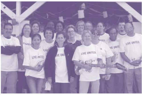
Cheerful volunteers from Belimo Air Controls

It's amazing what can happen when you simply take the time to lend a helping hand.